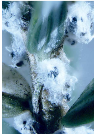
Filaments of wax are secreted by hemlock woolly adelgids as they feed.

winter temperatures have caused some HWA mortality in the eastern United States, but populations may build back up within a few years. Although hemlock woolly adelgids cannot fly, life stages can be blown by the wind or transported on birds, animals or even on clothing. Long-range spread of HWA occurs when people transport and plant infested hemlock nursery trees into new areas.