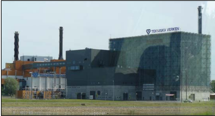
CHP plant with electric capacity of 19 MW and heat capacity of 83 MW.

A C ombined H eat and P ower (CHP) plant processes heating, cooling, and electricity from a feedstock such as coal, biomass, etc. An alternative definition is C ooling, H eating, and P ower. Conventional power plants typically utilize feedstocks for electricity generation alone. The boilers that turn the electricity-generating turbines produce a lot of heat, but that heat energy is typically vented up the smokestacks. Since 1960, the average efficiency of conventional power plants has run about 33 percent. 1 Of course, technology upgrades can increase the efficiency of coal-fired power plants.