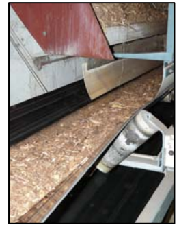
Woody feedstock supply conveyor into a biomass powered CHP plant.

CHP plants that use biomass feedstocks can sell carbon credits or “green” credits in financial markets where such systems are developed. These credits can be an additional and important revenue stream for the energy company. In states with renewable energy portfolios, electric utilities are required to produce a percentage of their power from “green” sources. For states that define wood as a “green” energy source, wood can be an excellent sustainable and environmentally-friendly feedstock.