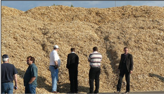
Shredded wood used to supply a small district heating plant.

The heating plant can be configured to use woody biomass as a feedstock (chips, shavings, pellets, etc.). Various configurations can utilize different combinations of renewable feedstocks, as well as traditional fossil fuels.