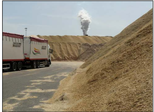
Wood feedstock for a large pellet plant.

assistance were made available. Hybrid poplar and willow show the most promise. Though plantations require energy inputs, research and practice in Swedish willow plantations show that outputs exceed inputs, and willow provides a significant portion of Sweden's domestic energy raw material.