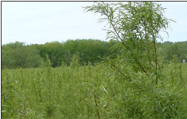
Willow energy plantation.

Extensive knowledge about forest soils and nutrient cycles will help support the sustainable use of wood in a bioeconomy. Michigan, Minnesota, and Wisconsin have each published biomass harvesting guidelines applicable to forest resources. A recent study on the Superior National Forest suggests that northern forests should be able to sustain increased biomass removal, but the economics of harvest may be an issue.