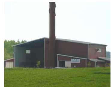
Small district energy plant.

Wood holds great promise as a renewable and sustainable energy source. Michigan could use more renewables—wood, wind, solar, agricultural residues, manure, and municipal solid waste--to meet energy demands. Conservation and efficiency practices could also contribute to a much reduced reliance on coal, oil, and natural gas. Most likely, society and the marketplace will determine how far and how fast we engage an expanded bioeconomy.